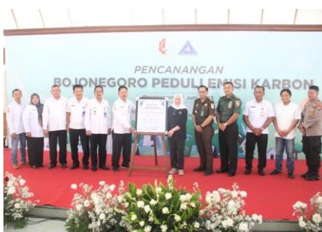
Figure 3. Bojonegoro's declaration of Carbon Emission Awareness

to take action to adapt and mitigate climate change by reducing carbon emissions and increasing public understanding of carbon emissions and climate change, simultaneously, the Bojonegoro District Government through DLH, in collaboration with PT Asri Dharma Sejahtera held the "Adibuana Carbon Award" which involved the participation of 430 villages from 28 sub-districts, and 30 of them were awarded because they were able to absorb the most emissions. This activity received appreciation from the Ministry of Environment and Forestry because it was considered effective in encouraging community groups to take action to adapt and mitigate climate change by reducing carbon emissions. In addition, this activity also provides appreciation in the form of incentives to selected villages, which is considered to strengthen their resilience and commitment to dealing with the impacts of climate change. In addition, this activity promotes the adoption of a low-emission lifestyle among the community.