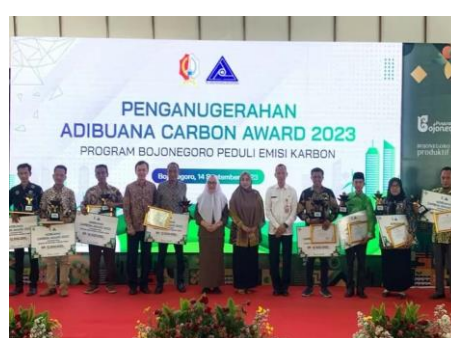
Figure 4. Adibuana Carbon Award