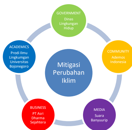
Figure 2. Pentahelix Model in Climate Change Mitigation in Bojonegoro District

In implementing climate change mitigation in Bojonegoro Regency, five Penta helix elements are involved, namely ABCGM (Academics, Business, Community, Government, and Media). Stakeholders work together to achieve common goals. The contribution of these stakeholders can be seen from the roles performed based on their respective main tasks and functions. The following author describes the contribution of each stakeholder in the implementation of climate change mitigation in Bojonegoro Regency: